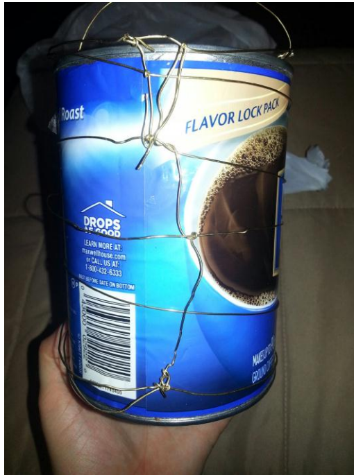
Figure 2: An example of how to link each level together.