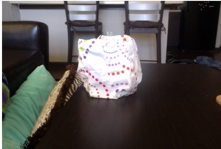
Figure 5: An example of the final product.