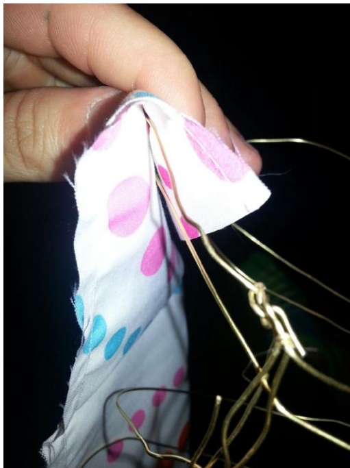
Figure 4: How to fold the cloth to glue together.