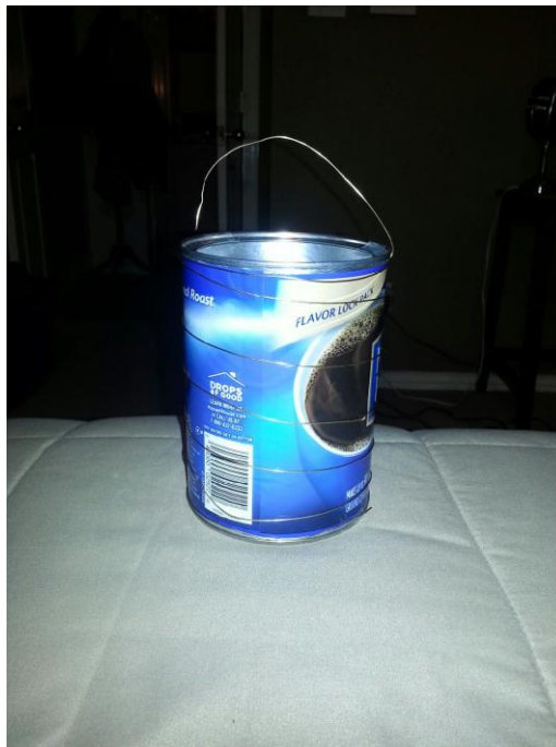
Figure 1: A sample of the wire wrapped around the cylinder object (coffee can).