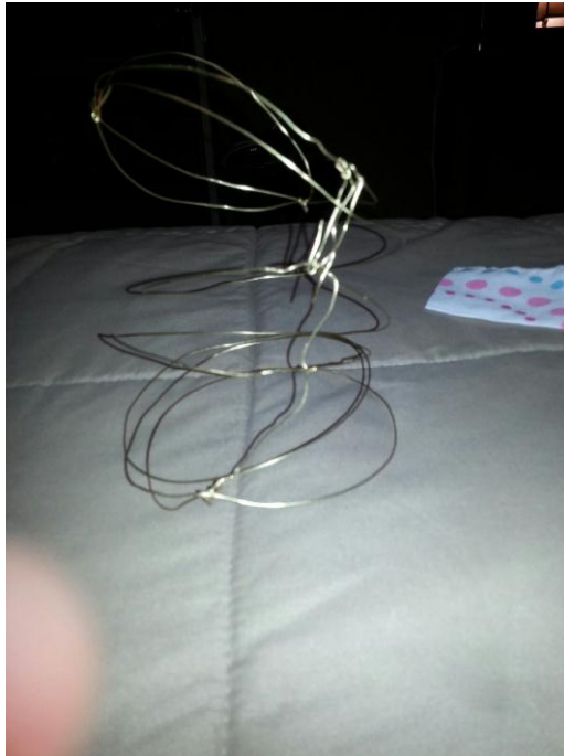
Figure 3: The cylinder mold.